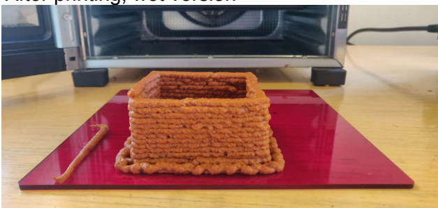
After printing, wet version